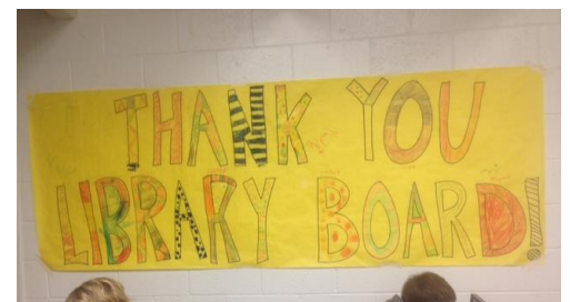
A Thank You Banner from Riverside Students

Each student in the Snake River District will receive a free book, courtesy of the Snake River School Community Library Board. Each librarian either has or will have purchased books and developed a way for students to get a book of their choice, to keep. That's one way to get books into kids' hands. Research shows that students who own books and enjoy reading at home score better on tests and find more success in school.