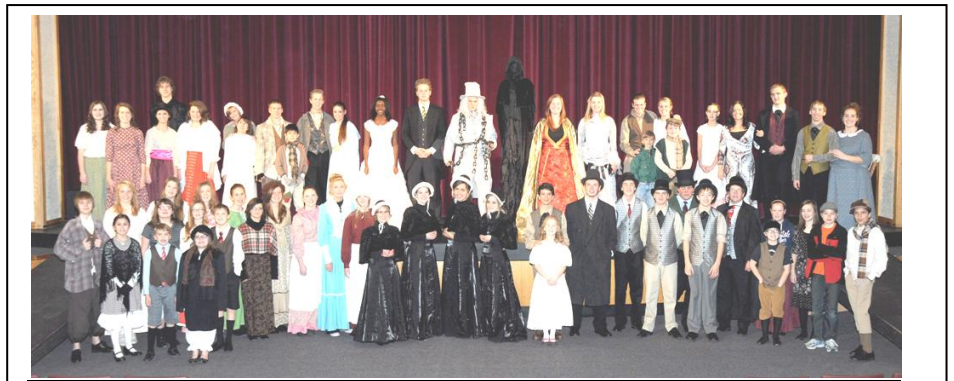
The Cast of "Scrooge, A Musical Christmas Carol"