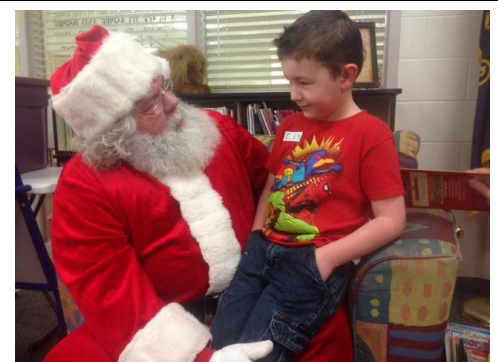
Santa Story Time!