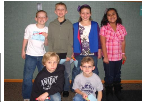
Hoop shoot winners: